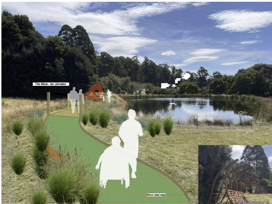
Area 2 Sketch View of Walkway to dam wall and boardwalk from reinforced grass path

Manager, Disability Support and Management Services Tasmania