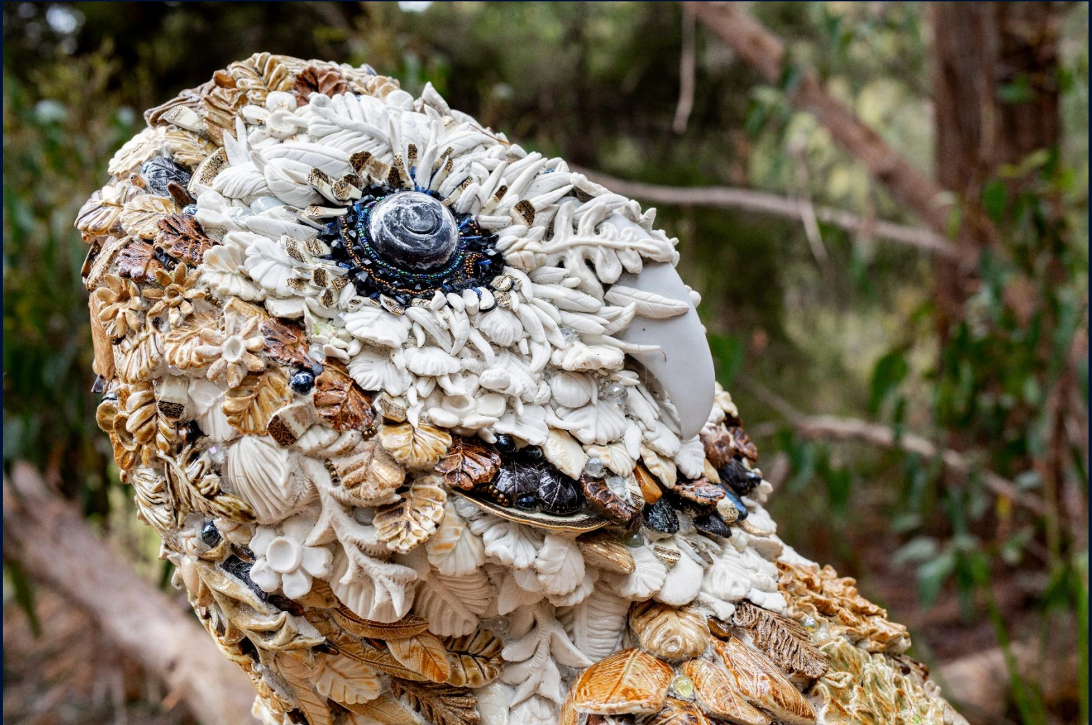
Who Who's Next? by Wendy Edwards, one of the tactile sculptures which will feature in the new accessible section of our trail