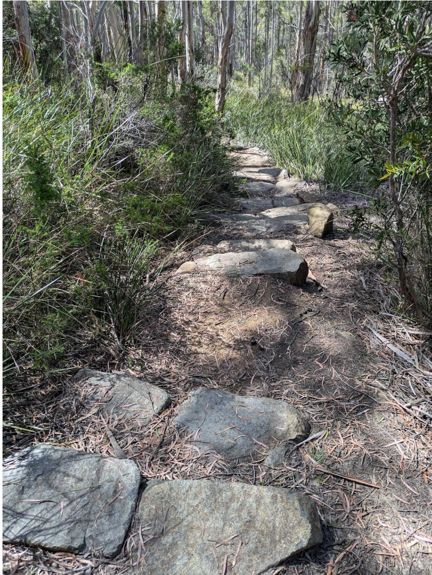
There are some stone steps on the way back down the hill.